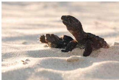
Hatchling Chelydra serpentina (Snapping Turtles), by Simon Pelletier

Take a look at some of the many other outstanding photos submitted so far!