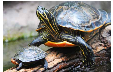
From top: Emydoidea blandingii (Blanding's Turtle) ; Box Turtles ( Terrapene carolina), Cooters ( Pseudemys concinna).

Follow all of the Year of the Turtle news and happenings on Facebook ( http://www.facebook.com/pages/Year-of-the-Turtle-2011/158410367533653 ) and Twitter ( http://twitter.com/YearOfTheTurtle ).