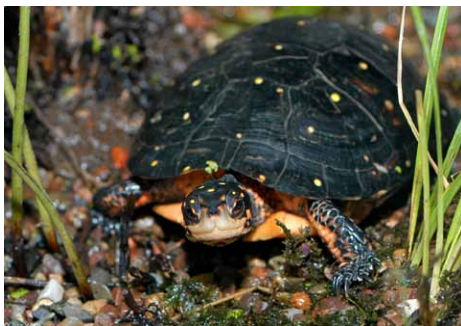
Spotted Turtle, J. White

Important progress is being made already with our US turtle heritage. The freshwater turtle science