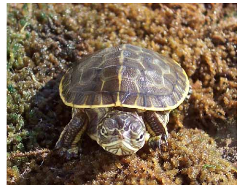
Chicken Turtle hatchling, J. Mitchell

A peculiarity of many species of turtles is that the sex of an individual hatchling is determined by the temperature of the nest. If turtle nests become too hot or too cold, then only one sex is produced. If that trend were to continue over time, reproduction would be reduced significantly. Turtle scientists now are trying to understand how global warming might interact with this odd trait of turtles. With all of the above threats, and with the unprecedented pace of change in climate features (temperatures, rainfall, extreme weather conditions), turtles may not be as resilient to changing climates today as they have been in their long history on Earth.