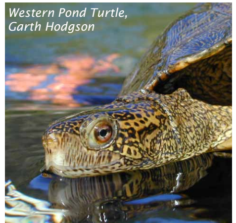
Western Pond Turtle

Habitat loss and degradation —Many turtles have small distributions, in other words, they are found only in a few locations. This heightens their risk of losses when habitat changes occur. Habitat of freshwater turtles includes both the surface waters where they live and the surrounding land where they nest. These areas can be subject to many types of human alteration, such as wetland drainage or water diversions. When the habitat of more widespread species is lost or degraded (because of land development or other land uses), larger populations become isolated and places to feed, mate, or nest become harder to find. Over a relatively short time, this can lead to population declines of 'common' species. Even large populations can be affected in short order. Habitat degradation can take many forms, and can include chemical pollution for some species. Oil spills can affect both sea and freshwater turtles. For sea turtles, city lights interfere with orientation; this is another form of habitat alteration adversely affecting these animals.