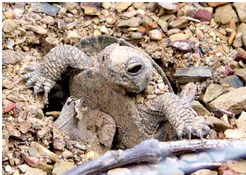
This Glyptemys insculpta hatchling was photographed while emerging from a nest on August 11, 2010 in Virginia.

We are seeking close-up, digital photos of turtles, preferably in their natural habitats or within an educational or conservation context. One winner will be selected each month to be the featured photo in the Year of the Turtle online calendar. Runner-up photos will also be included in the calendar. Additionally, all submitted images will be considered for use in the Year of the Turtle monthly newsletter and website as well as other Year of the Turtle related conservation, outreach, and educational efforts. Give us your best shot! For more information and for entry details, please visit www.yearoftheturtle.org .