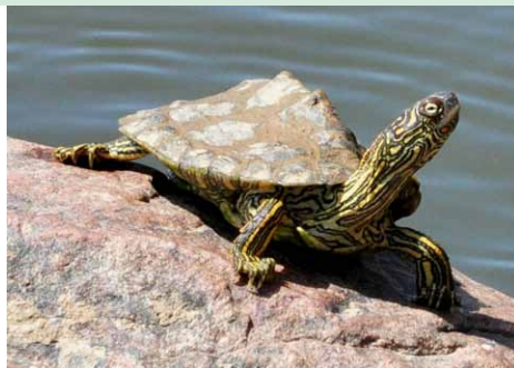
Texas Map Turtle

and conservation community, in conjunction with US state and federal wildlife agencies, recently developed recommendations for managing freshwater and land turtle populations. These recommendations include better monitoring and tracking of turtle harvests, as well as the need for more long-term population studies on wild turtles. This new guidance is intended to draw more attention to emerging US turtle concerns. In addition, a new effort is underway to better understand the current distribution of turtles. This Turtle Mapping Project begins in January 2011 (see http://www.parcplace.org/yotmapping.htm ).