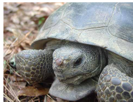
Gopher Tortoise