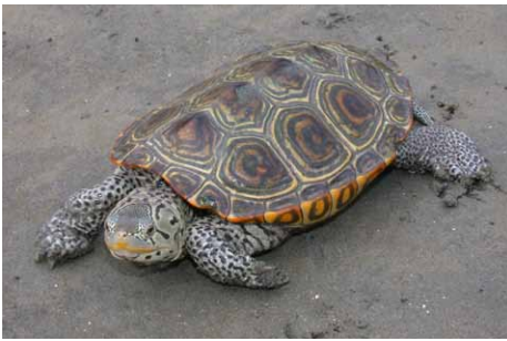
Diamondback Terrapin, J.D. Willson

Overexploitation of wild turtles for food, traditional medicines, and pets —Turtles that are removed from the wild for food, used as medicines, or as pets can contribute to population declines. When a large number of individuals are removed, the remaining wild turtles cannot produce enough offspring quickly enough to recover and maintain a healthy population.