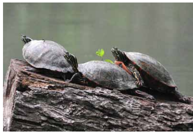
Basking Pseudemys gorzugi (Rio Grande Cooters) by Troy Hibbitts