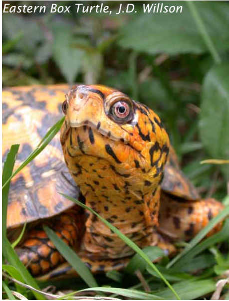
Eastern Box Turtle, J.D. Willson

America to Asia, it is believed that we live on the back of a turtle. Turtles also frequently appear in recent stories such as children's books and animated movies, often portrayed as gentle creatures helping others through their problems. Many people can recall specific instances of seeing turtles in the wild as children. It is clear that turtles are an important symbol of the connection between people and nature.