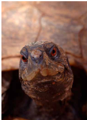
Male ornate box turtle (Terrapene ornata luteola).

little is known of the reasons because this burrowing species is elusive. Participants collect data such as habitat and land use from box turtle localities, which will allow us to determine where the species is still abundant and provide insight into the cause for their decline. For more information, visit the Ornate Box Turtle Watch website at www.azgfd.gov/boxturtlewatch .