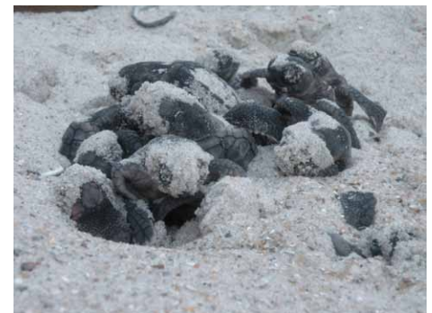
Loggerhead Sea Turtle (Caretta caretta) nestlings

Also in Alabama, sea turtle nesting has been monitored over the years with the assistance of volunteers along the gulf beaches of the Fort Morgan Peninsula in Baldwin County where the majority of sea turtle nesting