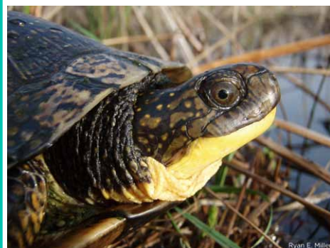
Emydoidea blandingii, Blanding's Turtle

“Behold the turtle. He makes progress when his neck is out.” — James Bryant Conant (1893-1978), educator and scientist