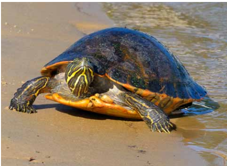
Adult female Alabama Red-bellied Turtle, Pseudemys alabamensis .

occurs. Last season, eggs from twenty nests were transported to Florida's Atlantic coast during the worst of the oiling of those beaches. After the major threat of oiling had passed, hatchlings were allowed to emerge and venture off into the Gulf as they would in any other year. Nest monitoring will continue and you can help! Anyone interesting in assisting this program can find more information from "Share The Beach" – one of our featured citizen science programs this month – at http://www.alabamaseaturtles.com/volunteering/ .