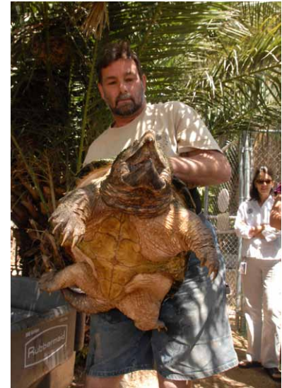
Sixty-two-pound alligator snapping turtle (Macrochelys temminickii) captured in 2010 during nonnative turtle trapping event in Phoenix.

Another serious issue threatening Arizona's turtles is the release or escape of captive turtles. Pet aquatic turtles are often dumped into urban water bodies when their owners can no longer care for them. With the help of hundreds of volunteers, we hold an annual nonnative turtle trapping at an urban Phoenix pond. We have trapped almost 600 turtles representing 15 species (only one native) during five years. The males are marked and returned to the pond. The females, and any restricted or injurious species (such as snapping and softshell turtles), are removed and placed with the Phoenix Herpetological Society in an effort to reduce breeding and slow their spread into native waters. In addition, through volunteers we