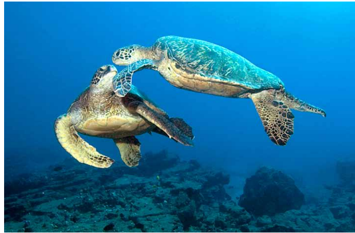
Green Sea Turtles, Chelonia mydas

Mississippi was also affected, and biologists are involved with the region-wide Diamondback Terrapin working group on the Natural Resource Damage Assessment (NRDA) process for Diamondback Terrapins and are exploring other avenues for studies investigating the impacts of the spill on terrapins. Biologists are also involved in sea turtle NRDA and are closely following