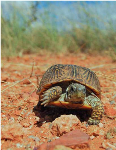
Ornate box turtle (Terrapene ornata luteola) in southeastern Arizona.

When most people think of Arizona, turtles generally don't come to mind. However, Arizona has six species of native turtles (Arizona, Sonora, and Yellow Mud turtles; Painted Turtle, Ornate Box Turtle, and Desert Tortoise). Arizona's turtles share many of the same threats faced by all North American chelonians, including the introduction of nonnative species and habitat loss and degradation from urbanization. The Arizona Game and Fish Department's Turtles Project manages turtles statewide through population monitoring, provision of grants, and coordination with state, federal, and private agencies. Citizen scientists also take an active role in our efforts: Here are a few of the many ways to get involved in conserving Arizona's turtle populations.