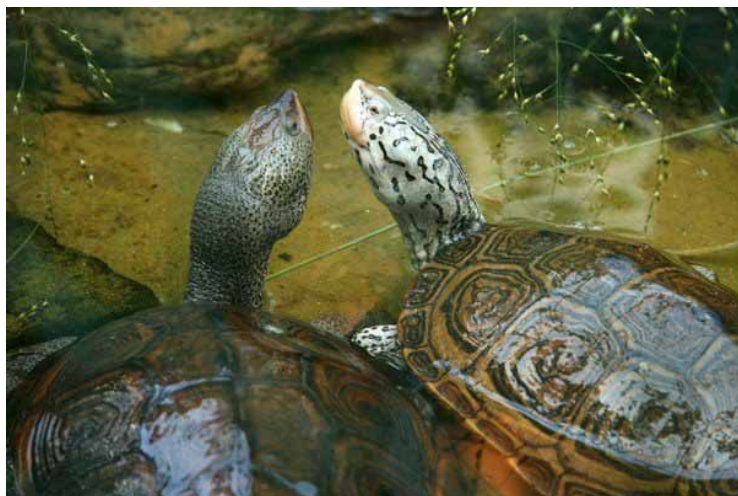
Diamondback Terrapins, Malaclemys terrapin