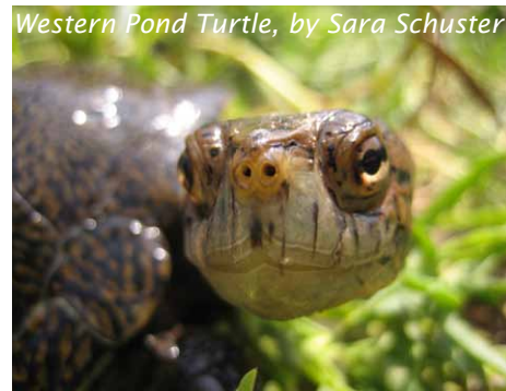
Western Pond Turtle