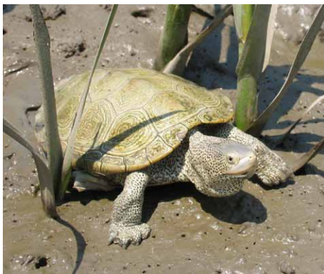
Diamondback Terrapin, Malaclemys terrapin

“Louisiana and other state and federal natural resource trustees are still collecting ephemeral data and assessing injury. Our shoreline and our resources are still experiencing oil and it would be premature at this point in the assessment to draw conclusions regarding the amount of injury or cumulative effects on our resources.”