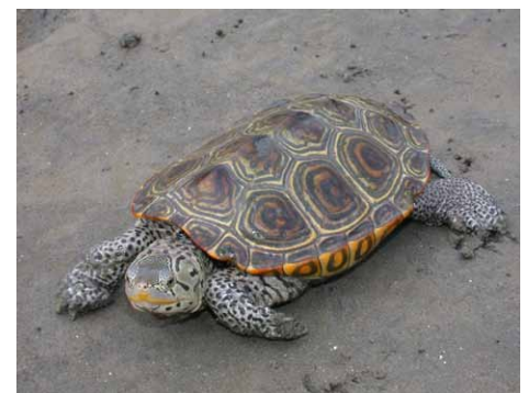
Diamondback Terrapin

The Year of the Turtle Team thanks our friends and colleagues at the Louisiana Department of Wildlife and Fisheries, the Mississippi Department of Wildlife, Fisheries, and Parks, the Alabama Division of Wildlife and Freshwater Fisheries, Alabama PARC, Southeast PARC, and the Florida Fish and Wildlife Conservation Commission for their helpful input on this article.