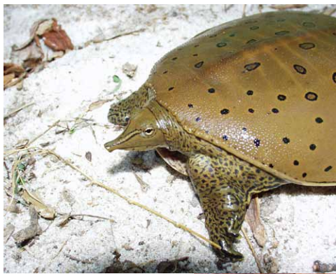
L: Spiny Softshell

Current Missouri commercial harvest regulations restrict harvest to the river channels of the Missouri and Mississippi Rivers and the portion of the St. Francis River along the shared Missouri-Arkansas border. Without