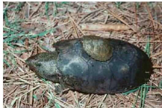
Flattened Musk Turtle.

3. Conservation Genetics and Site Occupancy of Flattened Musk Turtle ( Sternotherus depressus ), led by Dr. Leslie Rissler at the University of Alabama. The Flattened Musk Turtle is a federally threatened turtle that is endemic to northern Alabama within the Black Warrior drainage system north of Tuscaloosa. S. depressus was listed as federally threatened due to habitat alteration from practices including agriculture, mining, forestry, industrial and residential development, stream impoundments, and unlawful collecting. No range-wide evaluation of the status of S. depressus has been conducted in over 25 years, and no population-level genetic studies have been conducted. Objectives of the study are to: 1) evaluate the status of S. depressus across its range; 2) evaluate the effects of food availability and habitat quality on S. depressus site occupancy; and 3) to collect tissue from S. depressus across its range for a genetic study of population structure and gene flow.