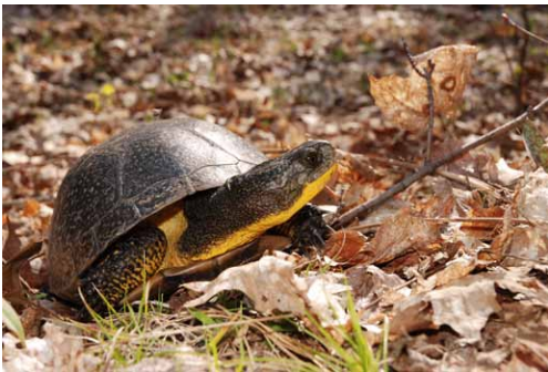
Blanding's Turtle, by Simon Pelletier

Seven of our 28 turtles returned to previous hibernacula from <1 to 15 m. We found that 60% of the variation of the distance between previous hibernacula could be explained by age and home-range size. The larger the home-range size, the further the distance between previous hibernacula, because in a smaller area there is a greater chance of hibernating in close proximity to a previous location. Juveniles had greater distances between hibernacula than adults even though they had significantly smaller home-ranges. Even though this species appears to exhibit philopatry of its hibernacula, home-range size must be taken into account before attributing it to site fidelity. - Amberly R. Moon, Virginia Commonwealth University, Dept. of Biology