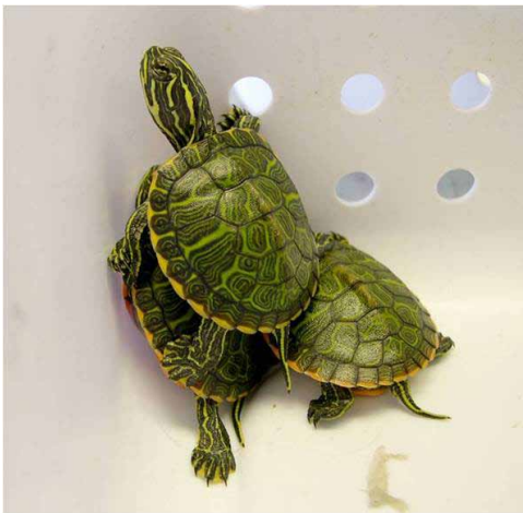
Headstarted Red-bellied Cooter hatchlings.