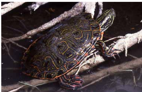
Western River Cooter, Eddy County, NM.

New Mexico is home to ten species of turtle, and the New Mexico Department of Game and Fish (NMDGF) has been active in their conservation. In 2010 the NMDGF published an article in its statewide newspaper insert to educate the public on the negative impacts of releasing unwanted pet Red-eared Sliders ( Trachemys scripta ) on a native species of turtle with a very restricted range, the Big Bend Slider ( T. gaigeae ). This year, the NMDGF continues its education program on behalf of turtles, publishing a “Turtles of New Mexico” poster. The back of the poster includes information on the PARC