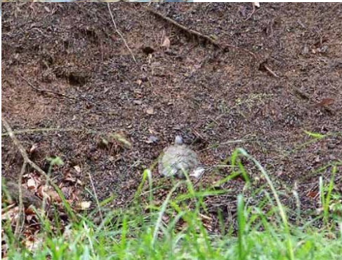
Wood Turtle depositing eggs in a nest dug into a road-side embankment.

Inland Fisheries' monitoring protocol, and a comparative demography and habitat use study was undertaken by Akre and Ernst (2006). As their range becomes contracted in Virginia, it may become increasingly important to maintain a metapopulation network in protected areas, such as national forests. With this purpose in mind, we recently began to investigate factors that influence nest site selection, nest and hatchling behavior, movements, and survival in a montane population on the national forest. As of July 2010, we have used telemetry and thread-spools to monitor approximately 50 females