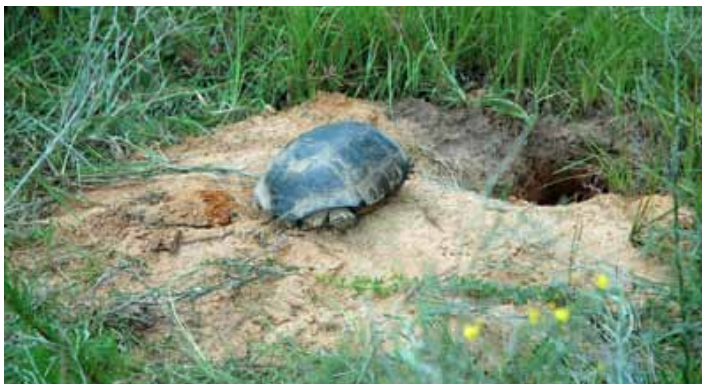
Gopher Tortoise heading back to its burrow. ADCNR.

on the Conecuh National Forest (CNF), the habitat structure of a significant portion of the forest has moved closer to the conditions found in old-growth longleaf pine forests. However, Gopher Tortoise populations on the CNF have not recovered to densities observed in old-growth forests. The slow recovery of tortoises makes it difficult to create features that will allow recovery of other missing species such as the Eastern Indigo Snake, Southern Hognose Snake, and Eastern Pocket Gophers. Therefore, implementation of active tortoise management to enhance populations on the CNF is vital for maintenance of the longleaf ecosystem on this key property. This project is: 1) working with staff at the CNF to develop a plan for implementing herpetofauna repatriation projects; 2) surveying and mapping burrows of Gopher Tortoises on a large site selected for release of Eastern Indigo Snakes; and 3) has established five large penned sites for relocation of adult Gopher Tortoises and juvenile Eastern Indigo Snakes.