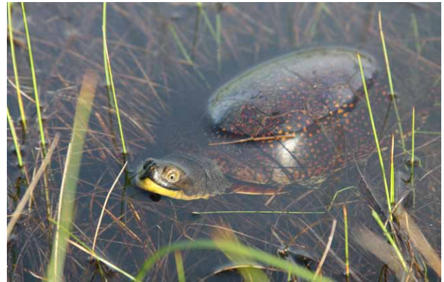
Blanding's Turtle ( Emydoidea blandingii ), photo by Jeff Hall.

On July 26, 2010, nearly 1,000,000 gallons of oil spilled from a leaking pipeline into Talmadge Creek along the city of Marshall in southwest Michigan. This spill quickly spread along a 25-mile segment of the Kalamazoo River. Locally, the oil spill was incredibly devastating, affecting countless animals, particularly the diverse and extensive herpetofauna population of the Kalamazoo River. During 2010, over 2,500 turtles of eight different species (Michigan has nine species of native chelonia) were collected from the oil-soaked river. Binder Park Zoo staff was instrumental in providing expert veterinary, husbandry, and cleaning assistance for the oil-covered turtles that were recovered from the Kalamazoo River, as well as coordinating with area zoological institutions, nonprofit organizations, and universities to staff the rescue effort. Approximately 2,000 of these transponder-implanted animals have been released back into the cleaned river system, and our vet staff continues to provide daily veterinary care to over 470 turtles that were overwintered before they are released into the watershed this spring and summer. Over 60 turtles have been hatched from ova from the overwintered animals and will be similarly released