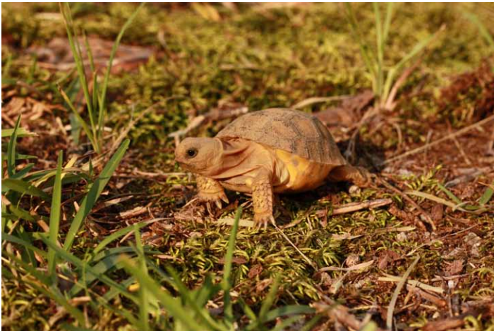
A young Gopher Tortoise on its daily rounds.

accomplishments include increased capacity for habitat management and restoration and implementation of research and monitoring projects.