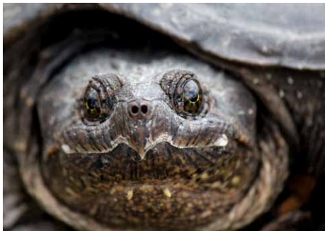
Common Snapping Turtle, by Ann Rogerson Weaver.

4. To determine if source of origin for the turtle species can be distinguished by use of isotope signatures.