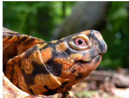
Eastern Box Turtle, by Andy Adams.

As a part of mitigation efforts, the Fisheries and Wildlife Division worked with the developer to undertake a project: Herpetofauna Inventory and Monitoring in the District of Columbia: Radio-Telemetry of Relocated Eastern Box Turtles ( Terrapene carolina carolina ). The Division staff captured and relocated T. c. carolina to a similar habitat site nearby to protect and conserve individuals. Given the tendency of T. c. carolina to demonstrate a homing response, the relocated turtles have been fitted with radio-transmitters and were marked for individual recognition. Their movements are being tracked on a regular basis in an effort to protect the relocated turtles and determine their movement patterns. Future efforts will include a long-term monitoring plan to monitor the establishment of home ranges and ensure species survival.