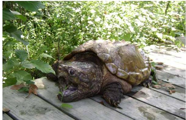
Yes, they do bite! Alligator Snapping Turtle photo by Joshua Ream.

To help in tracking the distribution and status of Kentucky's turtles and other herpetofauna, visit http://fw.ky.gov/navigation.aspx?cid=829&navpath=C741 .