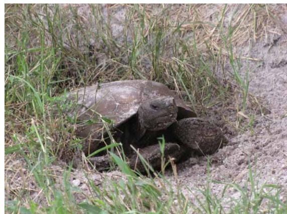
Gopher Tortoise in its burrow.

In June 2009, Georgia and three neighboring states received a $1 million federal grant to increase the quality, quantity and connectivity of prime sandhill habitat. The three-year project was aimed at benefiting Gopher Tortoises and as many as 54 other sandhill species that need significant conservation measures. Georgia, Alabama, Florida, South Carolina and groups such as The Orianne Society, The Nature Conservancy and the Gopher Tortoise Council provided $1.66 million in matching money and work for the U.S. Fish and Wildlife Service grant, part of the State Wildlife Grants Competitive Program. Plans called for increasing prescribed fire, removing non-native sand pines and overgrown hardwoods, and thinning pine plantations. These efforts are critical to the open canopy and diverse herbaceous groundcover typical of healthy longleaf pine, turkey oak-dominated sandhills. The overriding goal: Restore nearly 40,000 acres of priority public and private sandhill sites, rebuilding habitat for the tortoise and other priority species. The project could help keep Gopher Tortoises off federal endangered or threatened species lists and set the stage for long-term conservation of sandhills species. One year in, the states and partners have made excellent progress. Teaming with The Nature Conservancy of Georgia, the Georgia Department of Natural Resources conducted prescribed fires on 4,700 acres at high-priority sandhills sites across the Coastal Plain, including Yuchi Wildlife Management