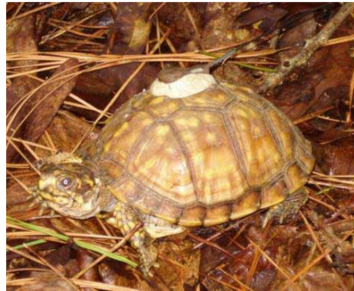
Box Turtle with iButton temperature data logger attached. Photo by Amberly R. Moon.

Grass wetlands no longer suitable for Bog Turtles. – Peter Rosenbaum, SUNY Oswego