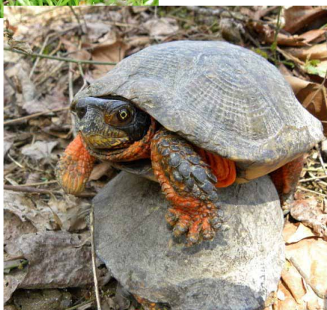
R: Wood Turtle, by Kyle Loucks.