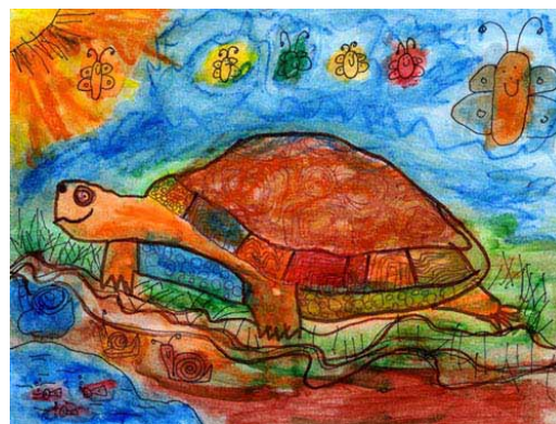
Julia Stamp's Wood Turtle won 1st Place in the kindergarten/1st grade category of the CTWD Turtle Art Contest.

The Wildlife Division developed a portable display on Connecticut's Turtles. It has been traveling to various conservation events, including a Turtle Day at the Mystic Aquarium in Mystic, Connecticut. When not traveling, the display is set up in the Exhibit Room at the Sessions Woods Conservation Education Center.