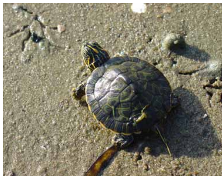
Hatchling Alabama Red-bellied Turtle.