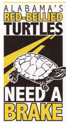
Endangered Alabama Red-bellied Turtles fell victim to highway traffic on the Mobile Bay Causeway until protective fencing was installed. Mortality has been greatly reduced.

More State Fish & Wildlife Projects on p. 9