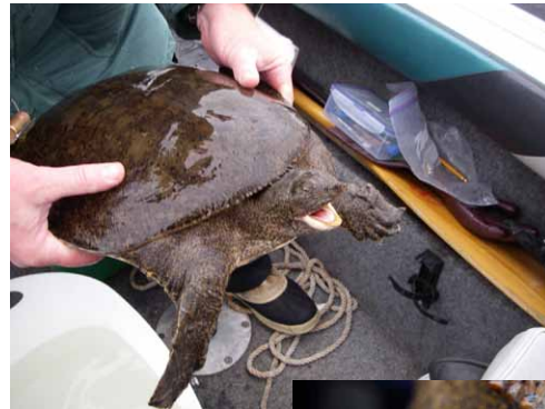
Spiny Softshell Turtles captured for radio tracking.

I am working with colleagues at the University of Vermont in cooperation with the VT Fish & Wildlife Department on efforts for conservation of the Threatened (state listed) Eastern Spiny Softshell Turtle ( Apalone spinifer ). Dr William Kilpatrick and I have been developing and analyzing three sets of genetic markers for the species in an effort to assess the genetic identity of the Lake Champlain population of Spiny Softshell Turtles. We plan to determine the number of subpopulations within the lake, the effective size of those populations, the migration rate between populations, and to measure the genetic diversity contained within the Champlain Spiny Softshell Turtle population. Field efforts aim to discover, manage, and protect nesting beaches and hatchlings along the Vermont side of the Lake Champlain shore. - Luc Bernacki, University of Vermont