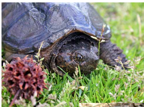
L: Common Snapping Turtle