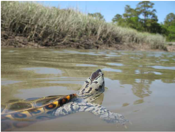
Diamondback Terrapin