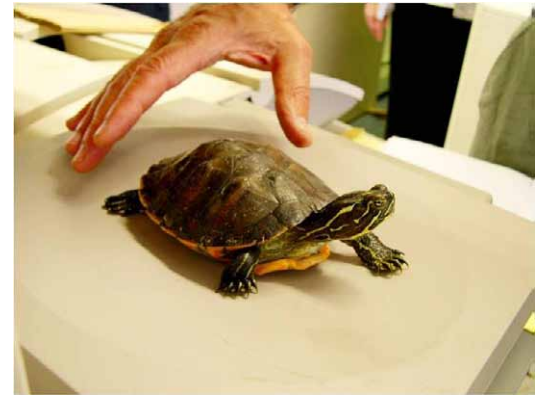
Headstarted hatchling Northern Red-bellied Cooter being measured before release.

Since 1985, headstarting of hatchlings has been one of the management tools used to increase the overall number of turtles, boost depleted populations in individual ponds, restore populations to ponds in which the species had disappeared, and to introduce the species to nearby water bodies with appropriate habitat. Over these 25 years, a total of 3,569 hatchlings were kept for headstarting. After being raised for 9 months over the winter by cooperating organizations, 3,339 (94%) hatchlings survived to be released at a significantly larger size in the spring. This process includes covering nests with a wire mesh cage to protect them from predators, monitoring each protected nest for emergence, releasing about 75-80% of all resulting hatchlings directly into the pond, and distributing the remainder of the hatchlings to cooperating organizations and individuals to keep over the winter. The first headstarted female confirmed nesting was a 13 year old found in 2000. Although the largest new population, which was established solely from the release of headstarted turtles, is in a wetlands complex covering parts of four towns and far too large to closely monitor, annual observations of adult headstarted females laying eggs are reported, and numerous large adult headstarted turtles are routinely observed basking together on logs.