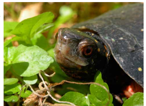
Spotted Turtle