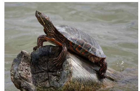
Big Bend Slider, Socorro County, NM.

Year of the Turtle program, as well as advice for conserving native turtles. New Mexico state herpetologist Charlie Painter is conducting surveys to update the status of the two turtles of greatest conservation concern, Big Bend Slider and Western River Cooter ( Pseudemys gorzugi ). The primary issue for the Western River Cooter is people shooting a turtle with a very limited range and population size in New Mexico. Finally, the NMDGF terrestrial species recovery coordinator Leland Pierce will be creating more outreach materials on behalf of both species. Anyone interested in obtaining a “Turtles of New Mexico” poster or other outreach materials may call NMDGF Public Information and Outreach at (505) 476-8000.