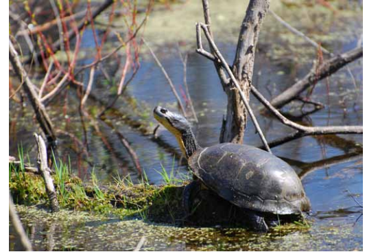
Blanding's Turtle basking, by Melanie Foose.

project is to maintain and enhance functional wildlife habitat in New England, New York, and Pennsylvania by applying conservation principles and practices needed to support a healthy Blanding's Turtle population. In the short-term, project partners will cooperate to develop a spatially-explicit conservation plan for Blanding's Turtles and associated SGCN in the northeastern United States, initiate standardized monitoring of the species' status, assess management units through genetic analysis, and initiate implementation of the Plan by managing habitat to reduce road mortality and engaging key partners to prioritize land acquisition, restoration, and management activities. In the long-term, conservation partners will apply information developed through this grant to maintain viable populations of Blanding's Turtle and associated SGCN in the Northeast through cooperative land protection, restoration, and habitat management.