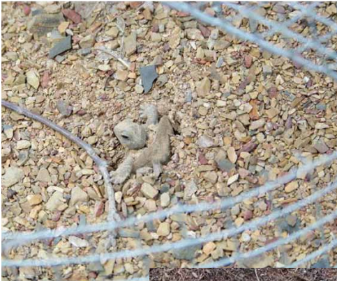
Emerging Wood Turtle hatchling in a protected nest.